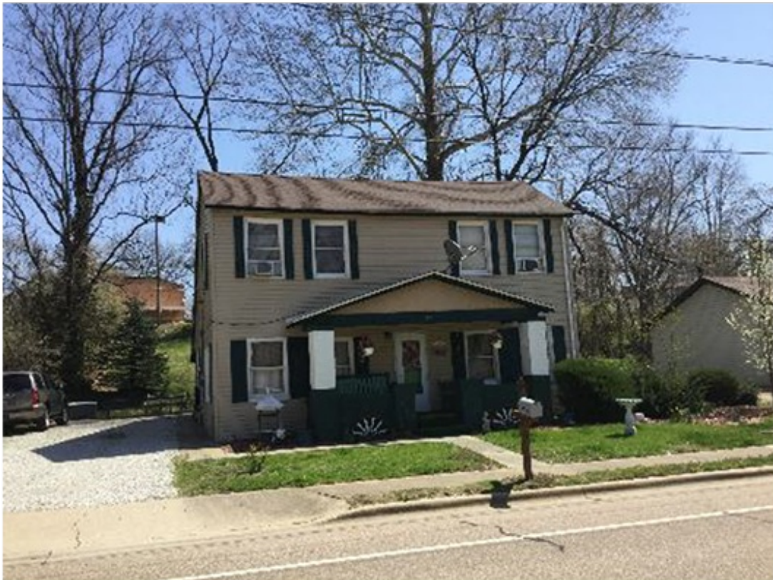
Rolens home located at 141 S. Main Street