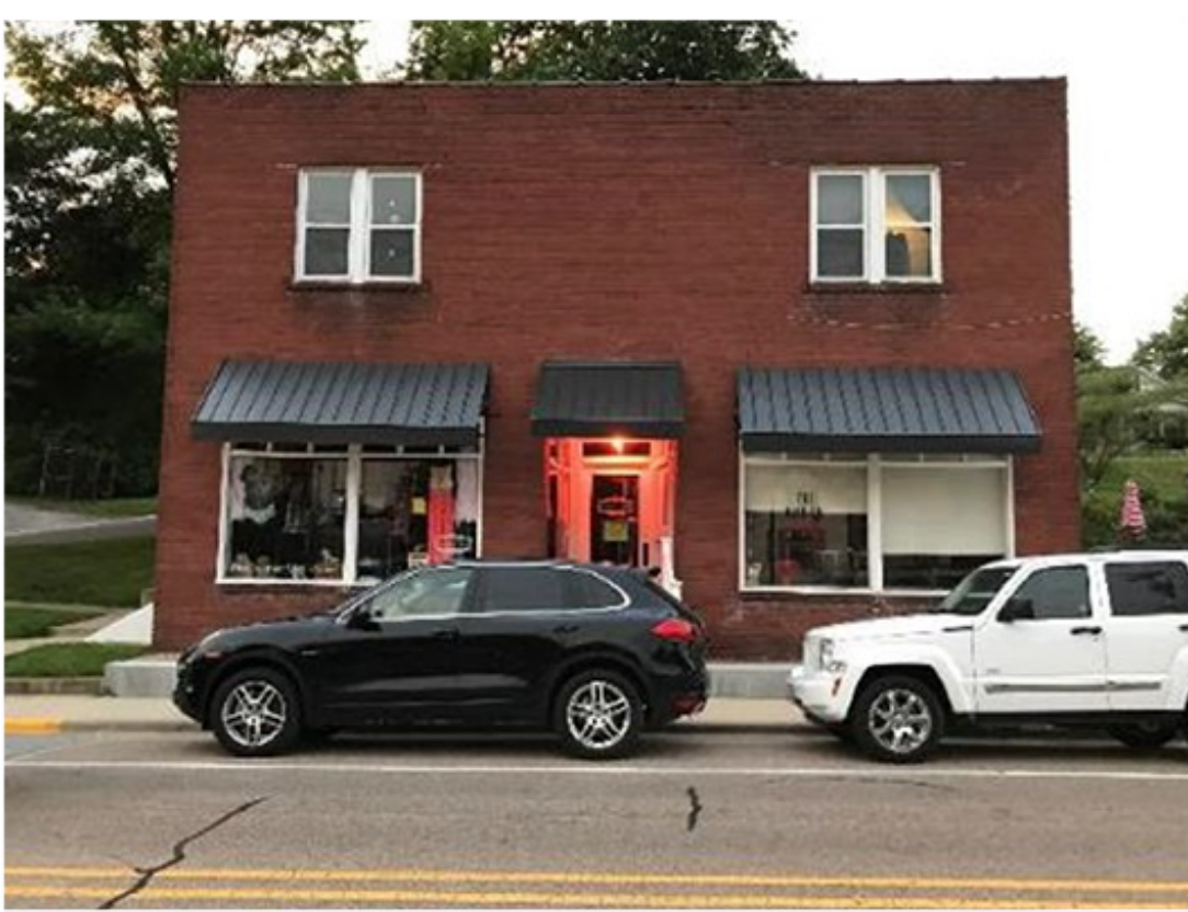
Groeteka Building located at 164 S. Main Street