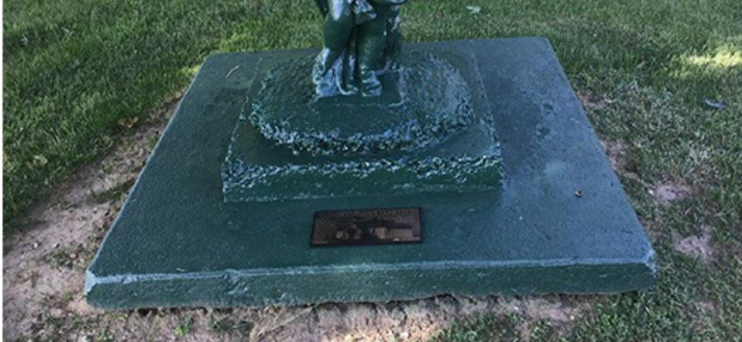
Acme School Well located at 1003 Glen Crossing Rd.